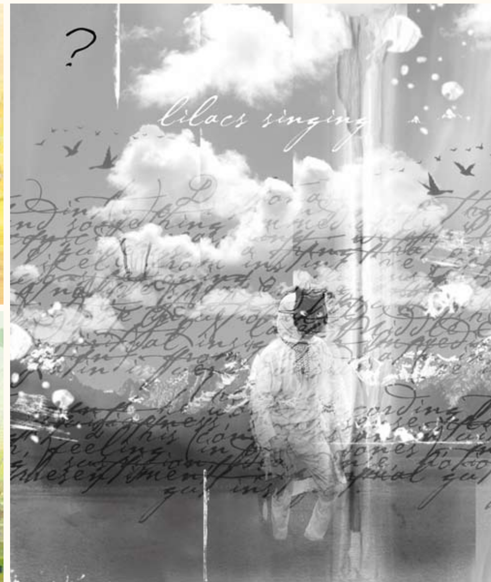
Illustration for Ascent magazine's article on intuitive reading