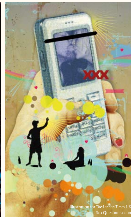
Illustration for The London Times UK's Sex Question section