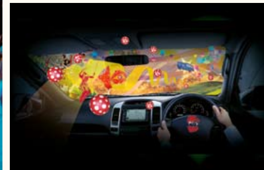
Illustration for the Toyota Prado, Saatchi & Saatchi, Sydney

Hey you... How did you start your career in the illustration and design industry?