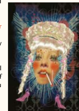
For more information on Sugar Power's work, visit www.lintmuseum.com or www.agoodson.com .