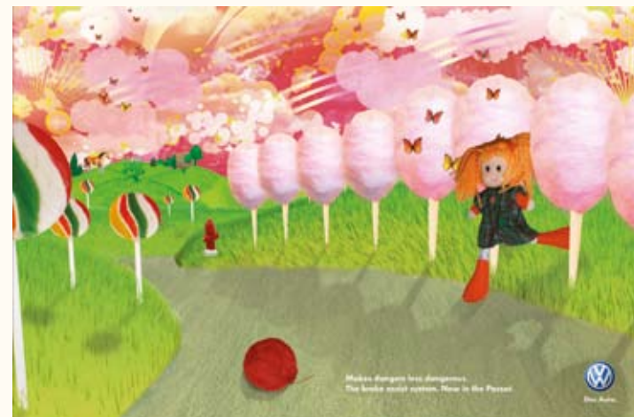
Volkswagen billboards, Grabarz & Partner

Your collage elements comprise of every, and anything. How does the thought process of one collage come about?