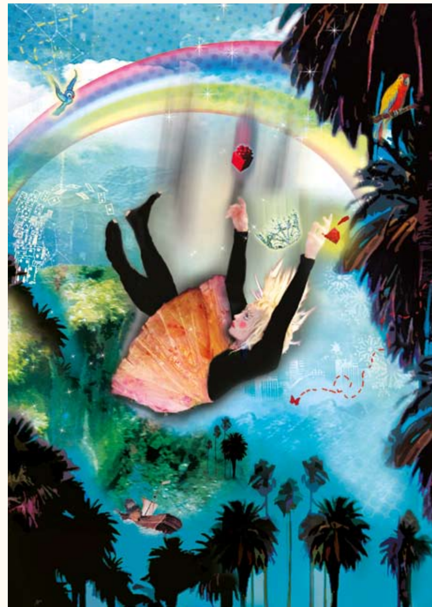
Promotional image - Alice falling down the rabbit hole